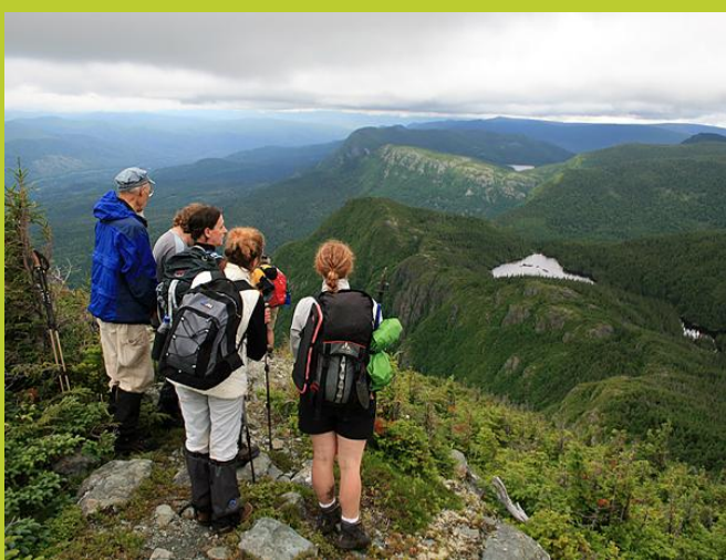
Photograph by Serge Ouellet, Gaspésie Hike Nature

http://adventure.nationalgeographic.com/adventure/trips/best-trails/worlds-best-grail-trails/